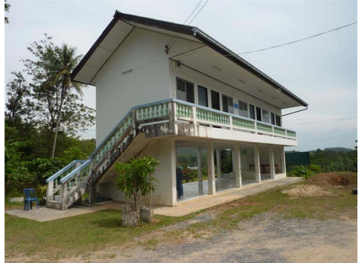
Building needing Clean up and painting