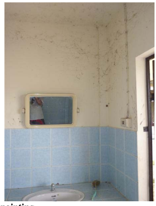
Toilet Building needs painting.

The plan would be to fished and the second floor walkway banister (the white concrete parts – top photos last page), the upper floor entrance hallway and doors, and the inside meeting / classrooms, and paint the small bathroom building both outside and inside (lower photos – last page).