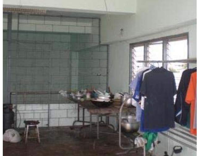
This is the kitchen where food for the 28 kids is cooked.